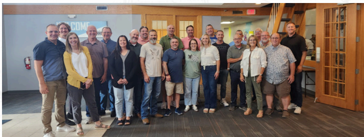
Nebraska Christian College Alumni Picture – Sept 22, 2025

As a September luncheon, CEM hosted the first Church Leaders Gathering with over 110 men and women in attendance, representing Restoration Movement churches in Iowa. Mini reunions were happening right in our midst, and new relationships were forged. It was the beginning of a larger story being written: our desire to be more closely connected than we have been in the last two decades. As we face the newest challenges of ministry, CEM leaders believe we can do so best in unity.